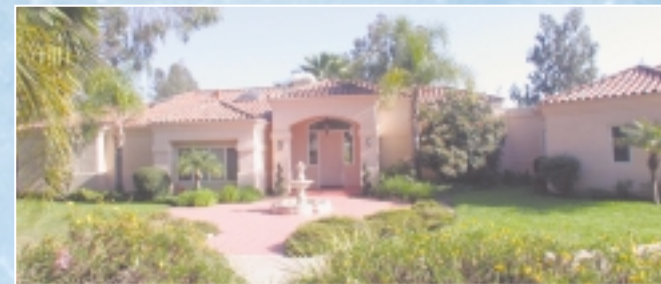
Comfortable Luxury, North Poway Private magnificence in beautiful Huntington Gate. Scenic grounds, pool and spa. Seller will entertain offers between $1,500,000 - $1,699,876.