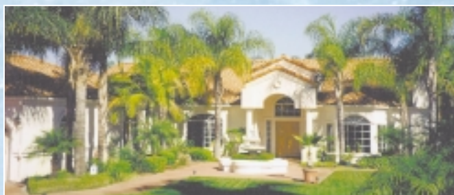
Gated Magnificence, North Poway Stunning interior, views, pool/spa and guest house. Seller will entertain offers between $1,500,000 - $1,699,876.