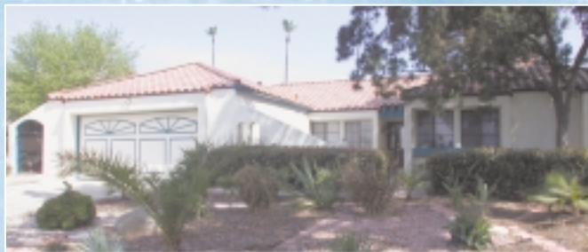
Stoneridge Golf Course Views, North Poway Move-in ready single level home. Golf cart path from yard to greens. Seller will entertain offers between $675,000 - $749,876.