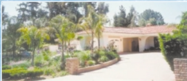
Green Valley Splendor, North Poway Grand home, tennis court, pool/spa & horses ok. Seller will entertain offers between $1,100,000 - $1,300,876.