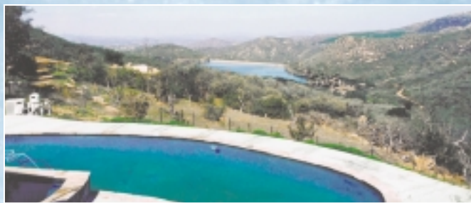
Lake Poway Views, Poway Newer custom estate with pool & spa in High Valley. Beautiful granite, marble and hardwood finishes. Offered at $1,395,000.