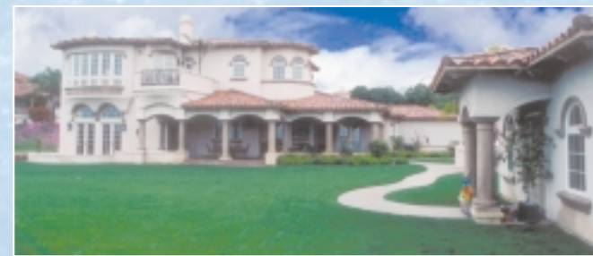
Forever Views, North Poway Built in 2002. Exceptional residence w/ guest house in Lomas Verdes Estates. Seller will entertain offers between $2,450,000 - $2,799,876.